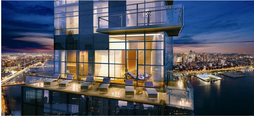
Who wouldn't want to pay full price for this swanky 1 Seaport pad?