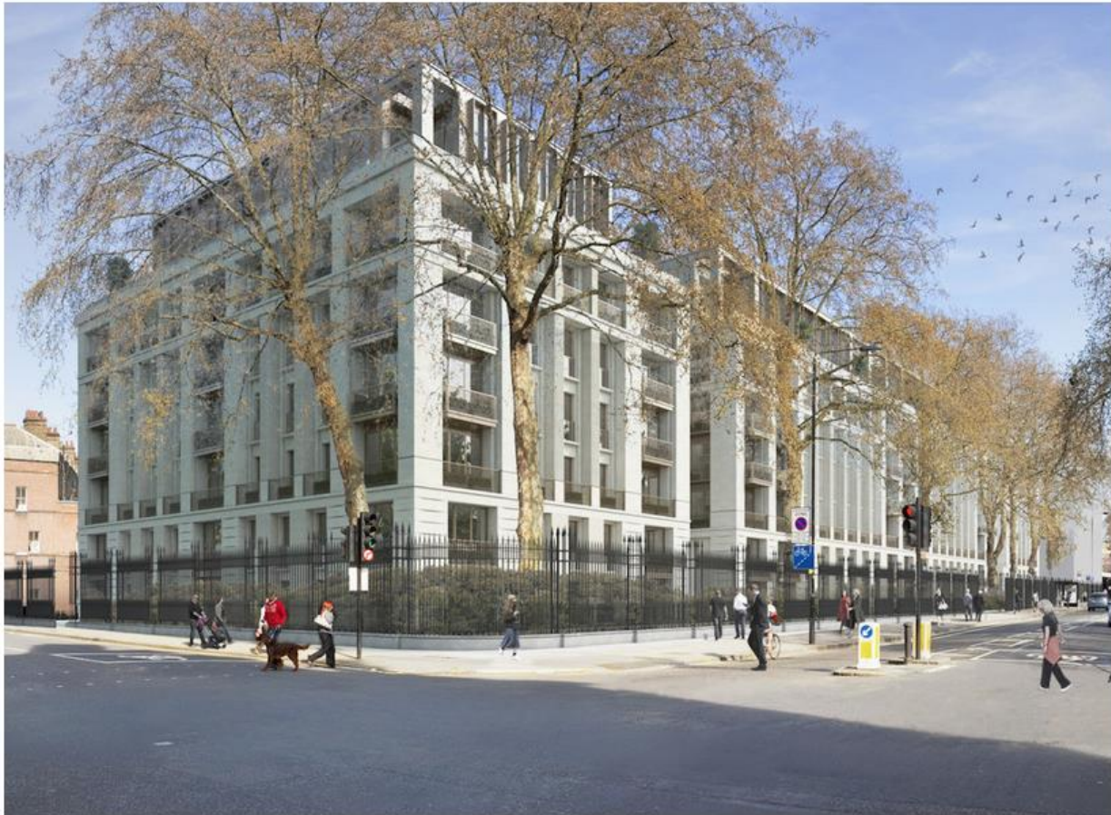
The $4.3 billion redevelopment of London's Chelsea Barracks, a former home for retired soldiers.